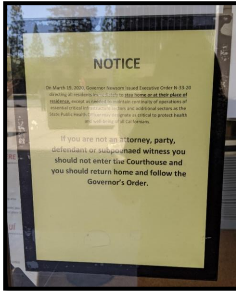
1415 Truxtun Courthouse Notice, June 18, 2020

7. In practice, however, Defendants have repeatedly denied members of the public and family members of those who are arrested access to the Court, even under this new regime. Instead, Defendants have denied Plaintiffs the opportunity to watch important criminal proceedings that stand to determine the course of their loved ones' lives. As recently as June 18, 2020, the courthouse at 1415 Truxtun Avenue still features the following signs and the March 23 rd Order is posted prominently on the courthouse door: